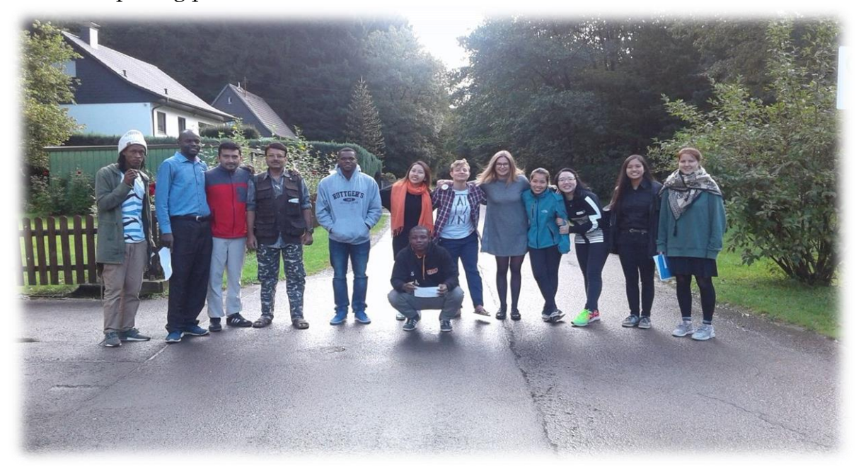
In Loppe, Engelskirchen

"Guten Morgen, we are from SCI - Service Civil International. We have 14 participants from 11 countries, almost all continents around the world. We have volunteers from Germany, Togo, Tanzania, Botswana, India, Malaysia, Indonesia, Vietnam, India, Sri Lanka and Ecuador. The theme of our workshop is: As if there was (no) tomorrow – global change for a sustainable future. "---- this was our standard opening phrase to the students when we first met them in schools.