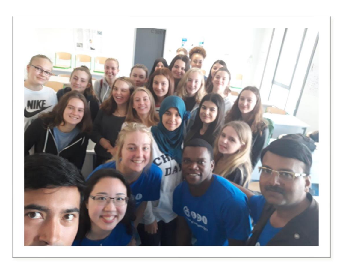
With our lovely students