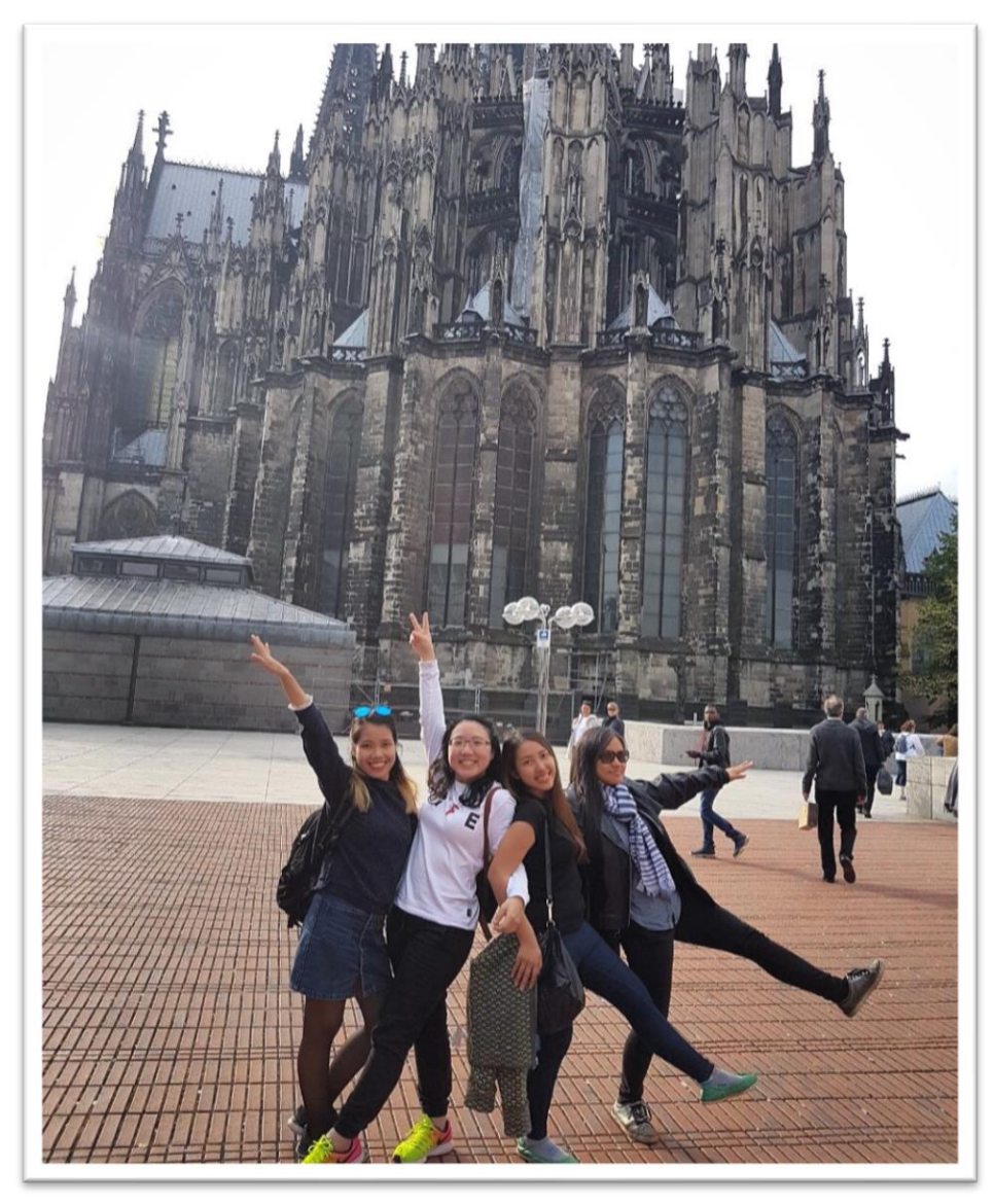
Asian team outside Cologne Cathedral which was built in 14th century

I hope that we did inspired and encouraged the students to improve their lifestyle further. It's everyone's responsibility to create a better tomorrow and save our mother earth!