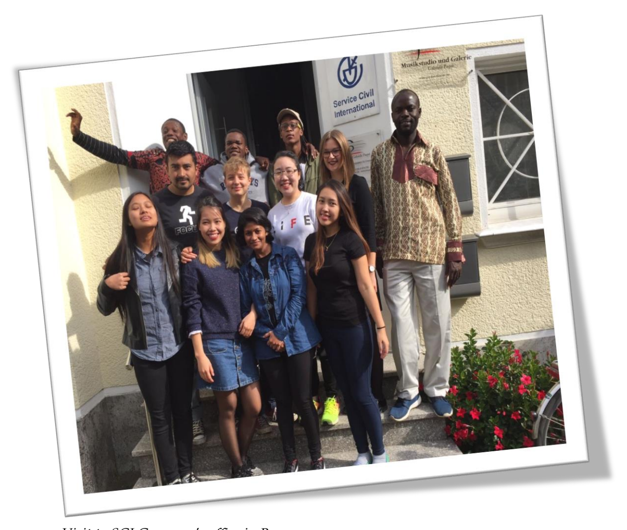
Visit to SCI Germany's office in Bonn

We helped the owner to beautify his garden by repainting the benches to avoid termites, levelled the rose garden, and 'transformed' the highway reflector post into pipe organ in the remembrance of a German composer -J.S Sebastian Bach. The campsite was down at the South-West of Cologne. Hence, the weather was comparatively cold, the lowest temperature was 3 degree-Celsius only.