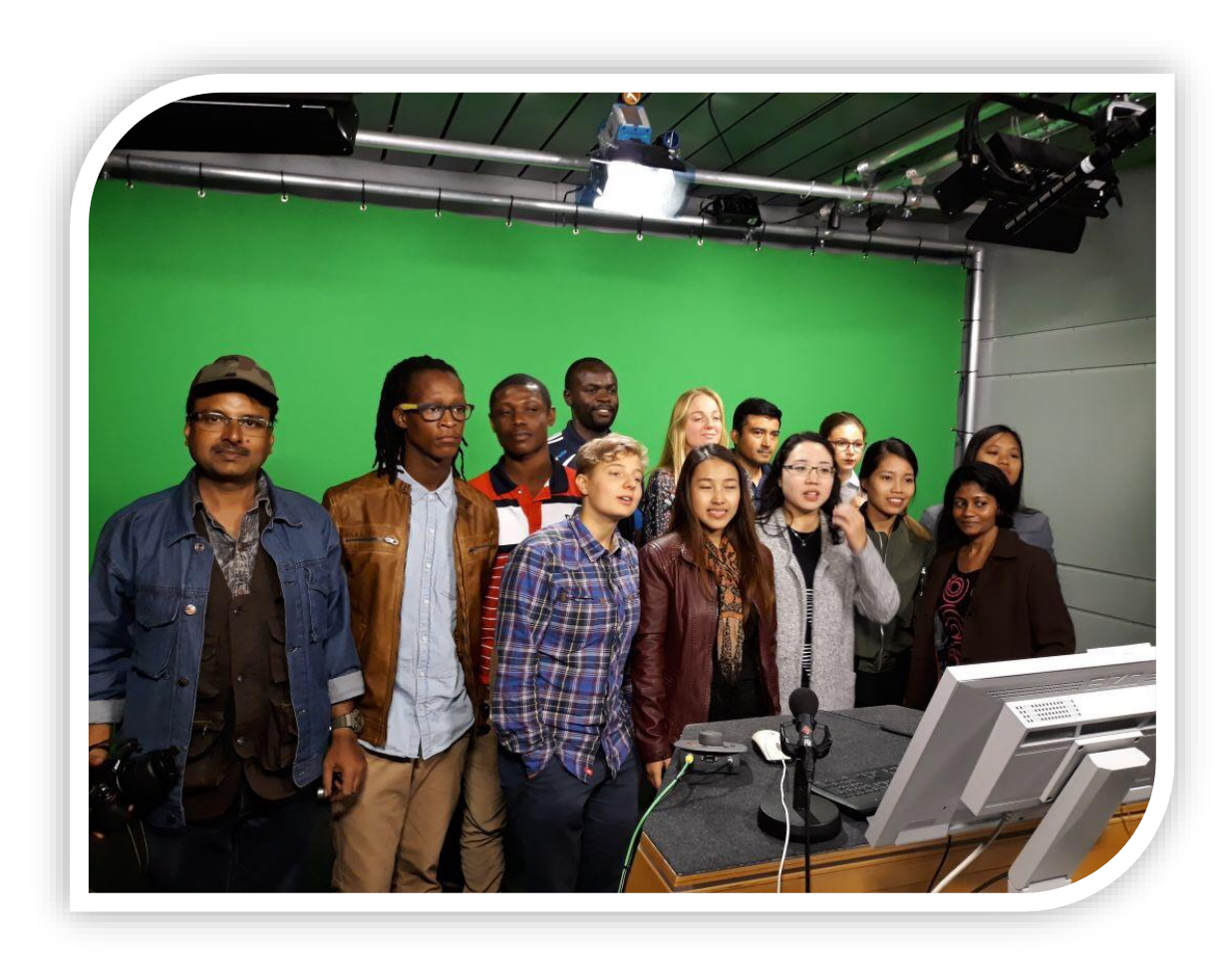
Visit to Deutsche Welle – Public International Broadcaster