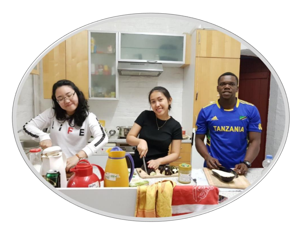
We cooked our own meals