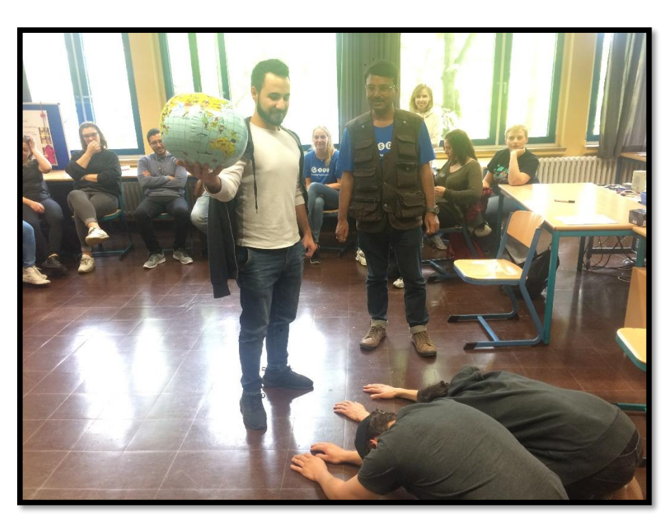
Role play on Power & Transformation