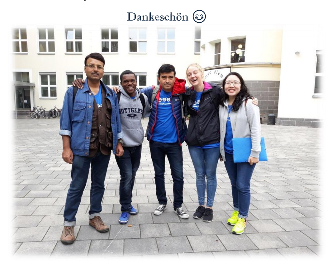
Our Motivation Group

"We do not remember days, we remember MOMENTS."