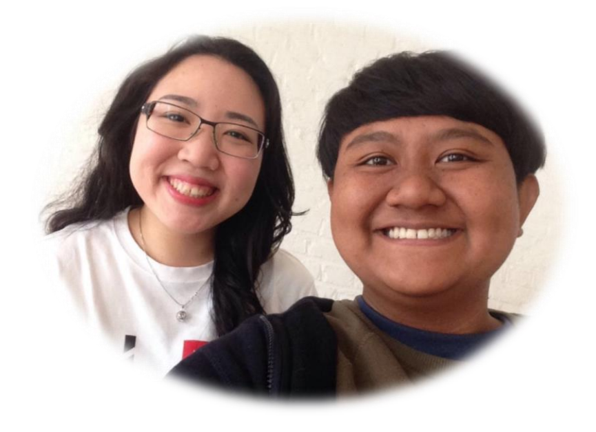
Meetup with Malaysia's one-year Long-term Volunteer